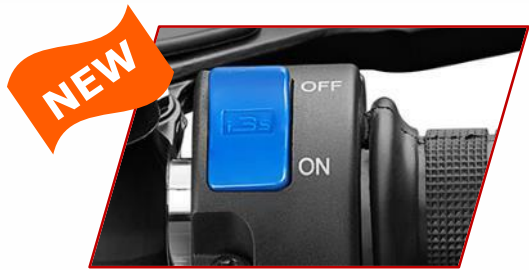
i3s Technology with Programmed Fi Technology