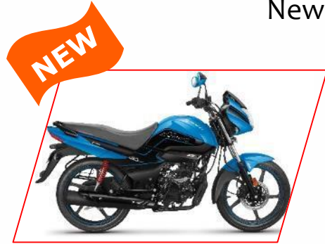
• Diamond Frame with Optimized Weight Distribution