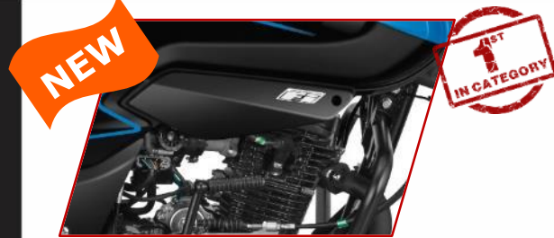
Programmed Fuel Injection Technology