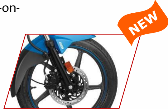
Front Disc Brake with IBS Technology