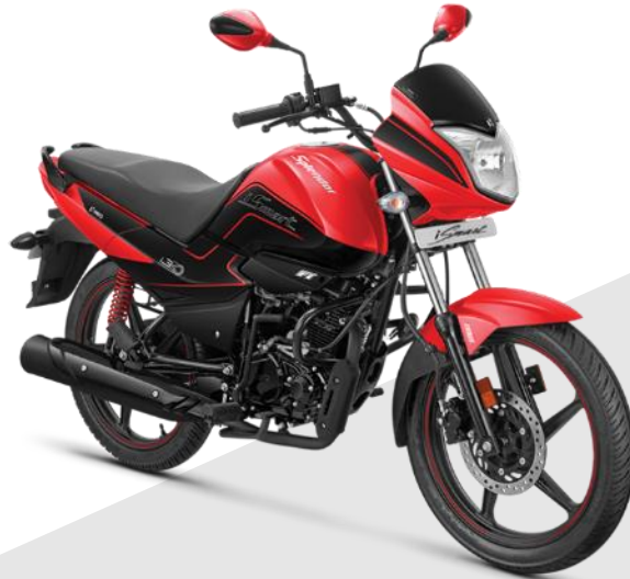
Sports Red & Black