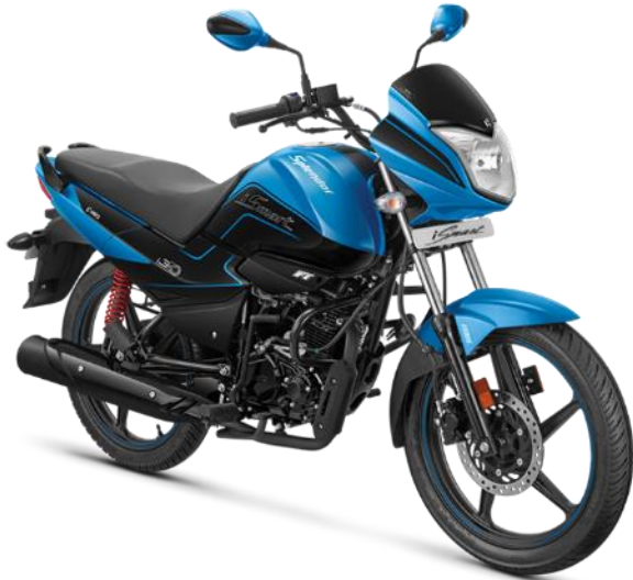
Techno Blue & Black