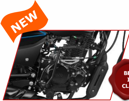
New Engine with More Torque-on-Demand (9.89Nm)