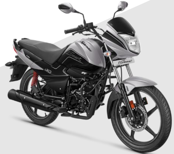
Force Silver & Heavy Grey